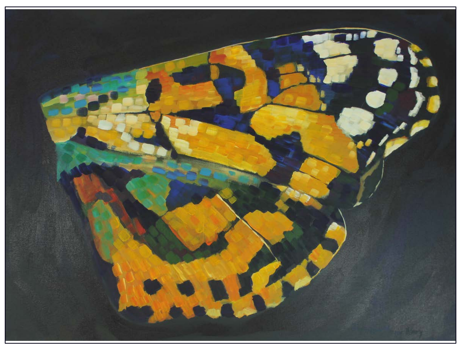
Wings of Freedom - II Acrylic, 80" x 40,"

Repeatedly she mentions family traits of modesty, simplicity, service and community. She also feels that she learned from her mother that women could do anything to which they set their minds, a common belief among Friends.