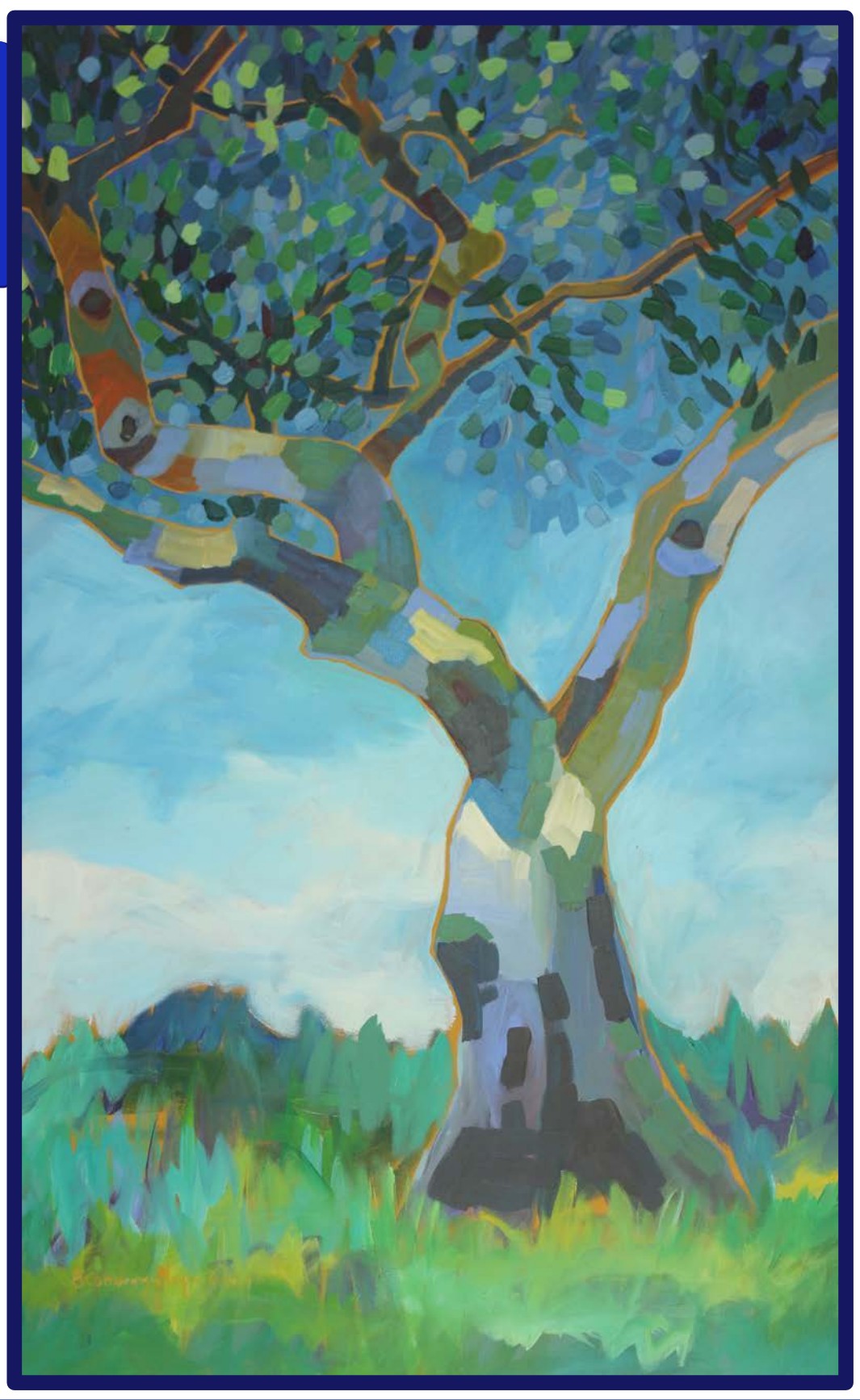
Issue 82 Winter 2019-20 Journal of the Fellowship of Quakers in the Arts