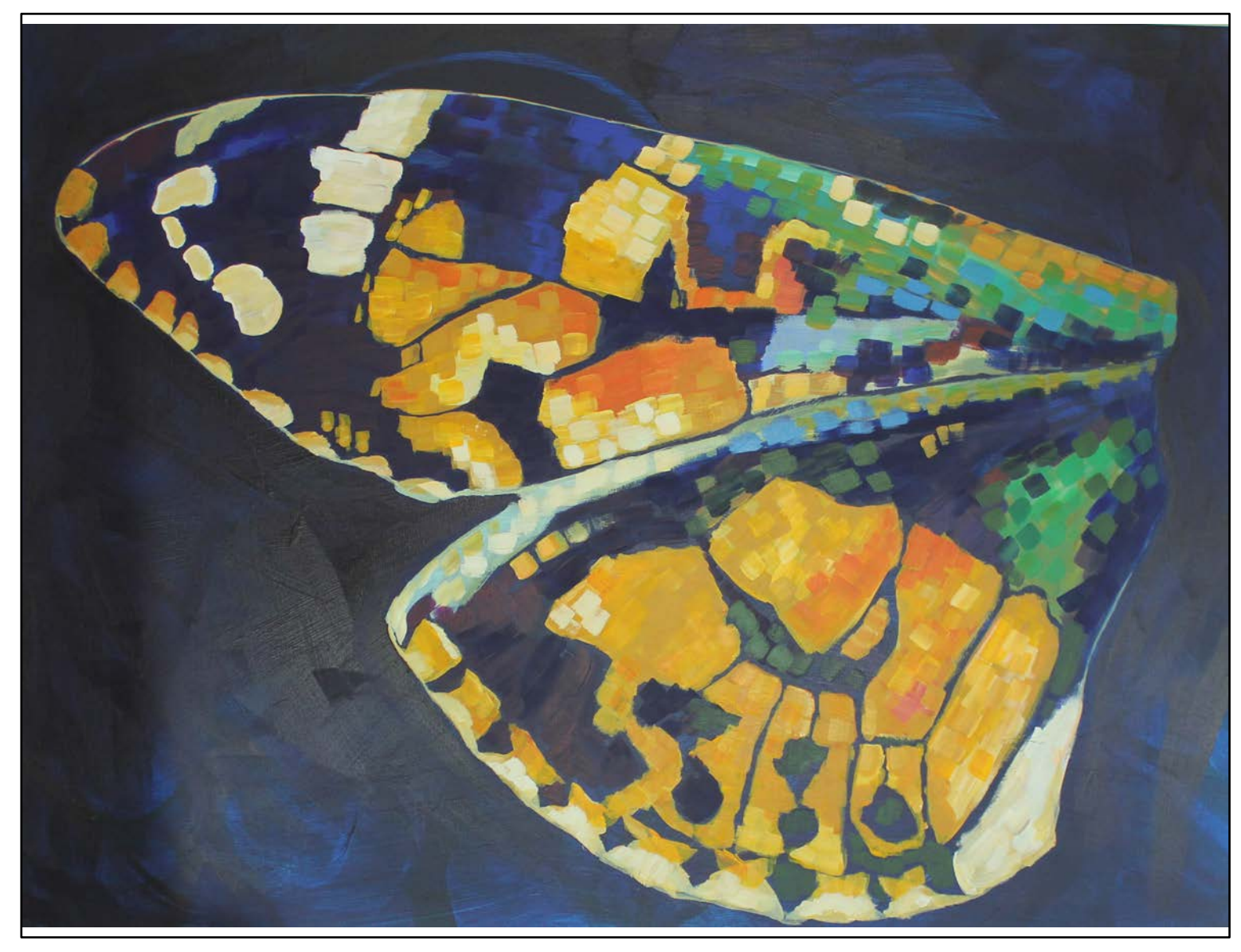
Wings of Freedom - I