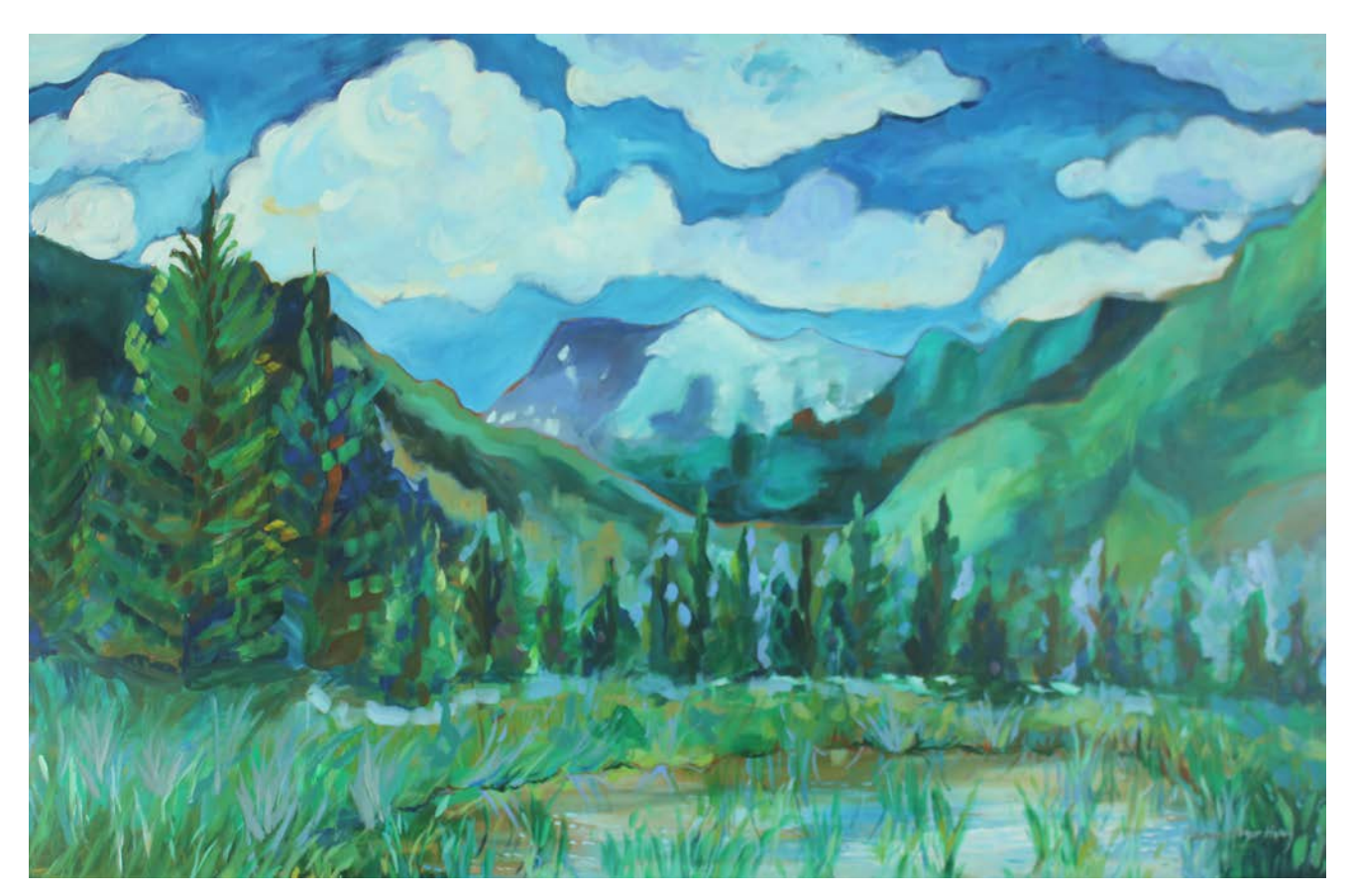
Above: "Beauty Immersion," Acrylic, 60" x 40" Below: "Motion of Love," Acrylic, 60" x 40," both © Bronwen Mayer Henry