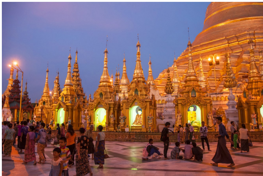
"Twilight at Shwedagon Pagoda"

I traveled to Burma/Myanmar in December 2013 with a photography group to capture images of the people and their culture. In the past I have mostly