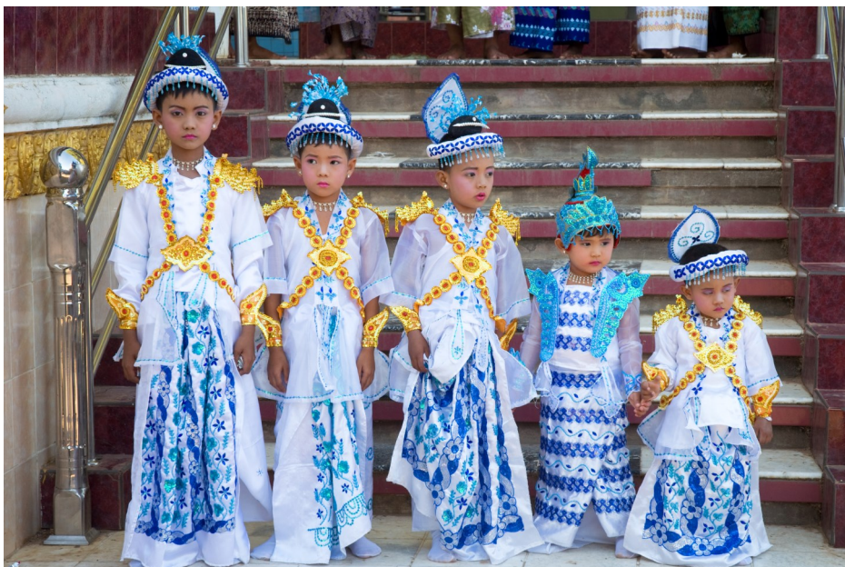
"Five Siblings Dressed for Novitiation" © Joanna Patterson

These markets are a bustling place of activity. Besides seeing local shoppers one could see monks and nuns with their alms bowls giving the vendors an opportunity to gain merit (by placing items in their bowls.) We visited oth-