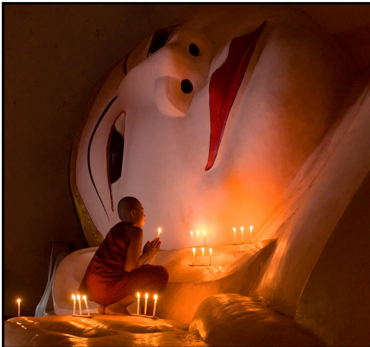
"Devotee at Buddhist Temple," Myanmar