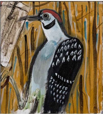
"Red Belly" 11" X 10" © R. Brown Lethem