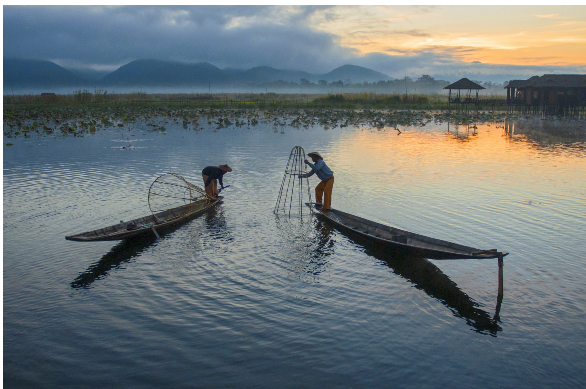
"Fishermen Plying Their Trade at Sunrise"

In Yangon (formerly Rangoon) at the holiest sight in Burma, we visited the Shwedagon Pagoda just before sundown. The site consists of a shrine 300 feet high gilded with 60 tons of gold and culminates with a spire bejeweled with thousands of diamonds and other gemstones. In