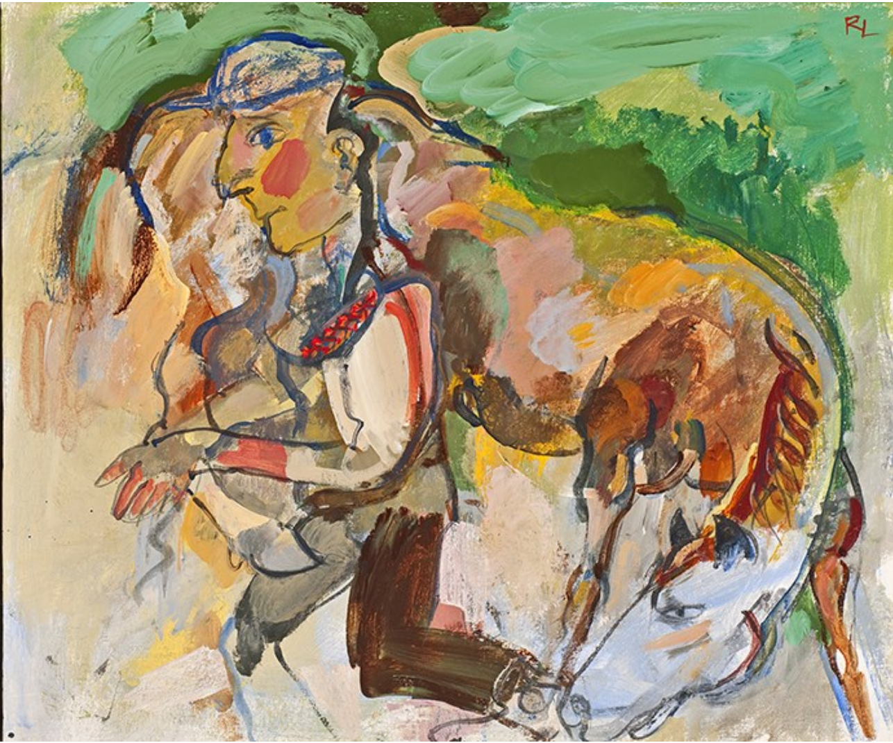
"The Good Vet" 20" X 24" acrylic on canvas © R Brown Lethem