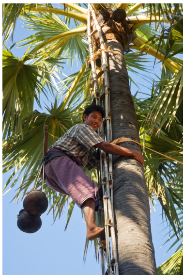
"Harvesting Toddy Palm Sap"

So many things are still done by hand in Burma just as they have been for generations. We were shown cheroot (cigar) making, dying, spinning and weaving of silk thread, making Sa paper from Mulberry bark, parasol making, pounding gold nuggets into gold leaf, as well as wood and marble carving.