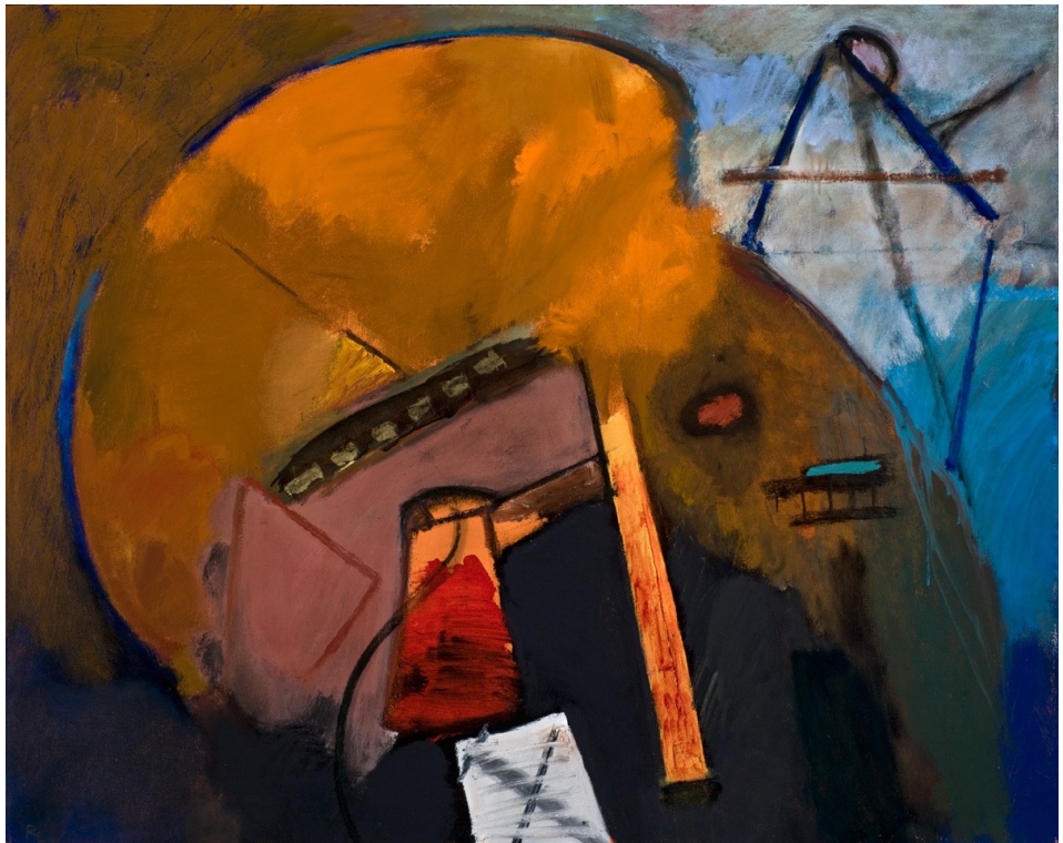
"The Broken Axe" Oil on Linen, 40" X 50," 2015 © R. Brown Lethem