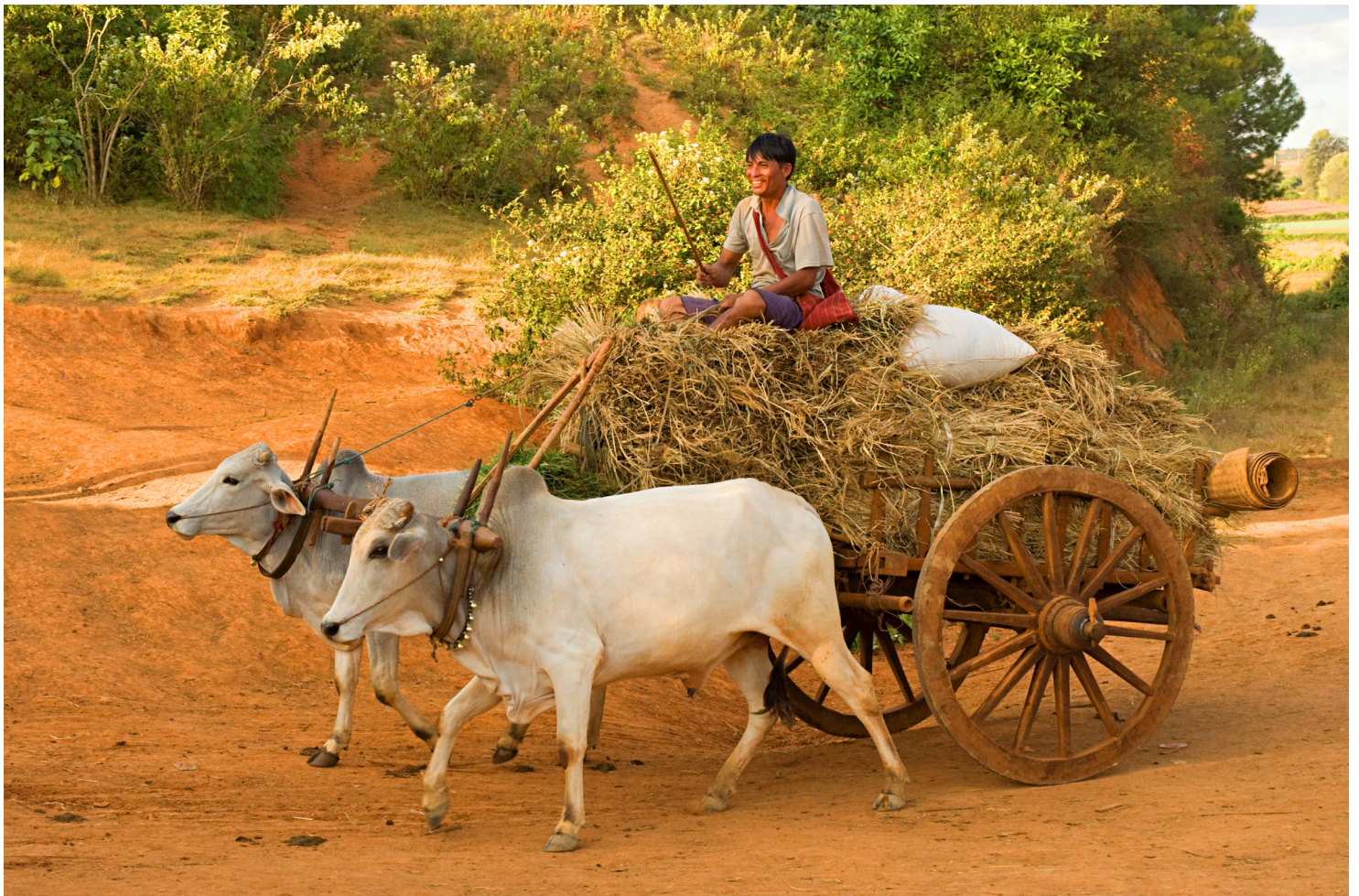
"Ox Cart Going Home with Harvested Hay, Myanmar