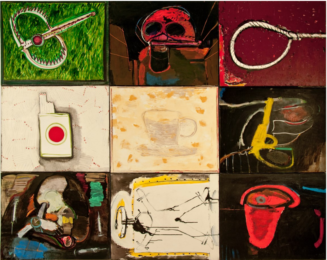
"Slave Ship," 72" X 90" Oil on Canvas, 1991 © R. Brown Lethem