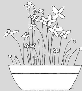
by Gary Sandman

The second edition of the book Quaker Artists contains the stories of the above artists and more: 286 reviews in all, a history of Friends, a history of Quaker art, study questions, artist's queries, 44 reproductions of the artists' works, 51 illustrations, a bibliography, an alphabetical index and an artist's index. The period covered is 1659 to 2015. Friends from 18 different countries are included. Poets, painters, dancers, musicians, films and 13 other categories are included. (It is three times the size of the first edition!)