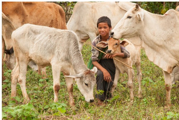
"Proud Calf Guardian" photos

er markets held in the open air where there was more room to move about making it easier to purchase or photograph.