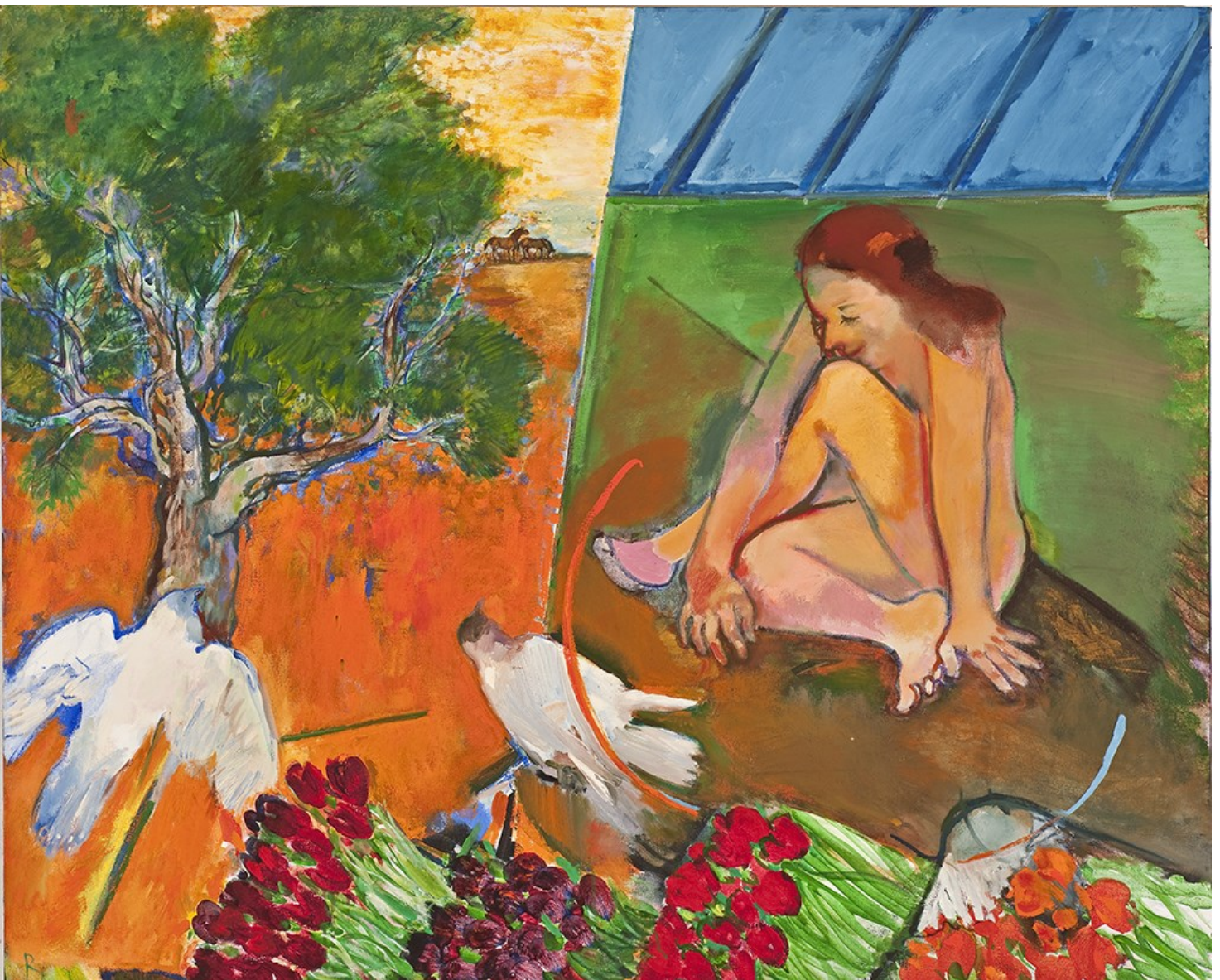
"The Greenhouse" 44" X 54" acrylic and oil on canvas, 2010 © R. Brown Lethem