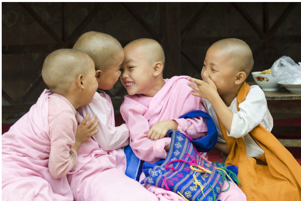
“Laughing Novice Nuns at Aung My oO Monastery School “

tional Buddhist teachings and finally perhaps the most impressive religious area was in Bagan where 10,000 pagodas were built during the 11 th – 13 th centuries, with 2,200 still standing.