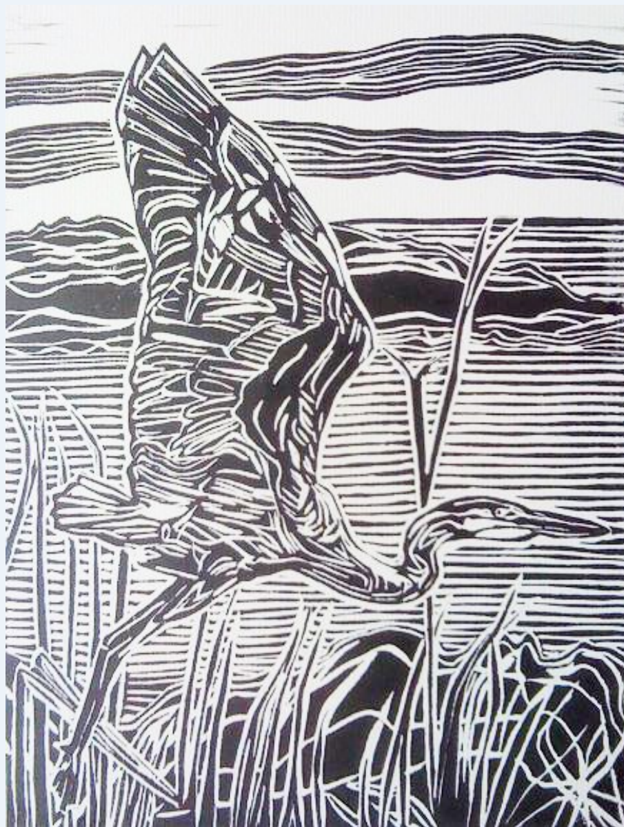
"Heron—2." 10" X 10," soft block print, acrylic block print ink