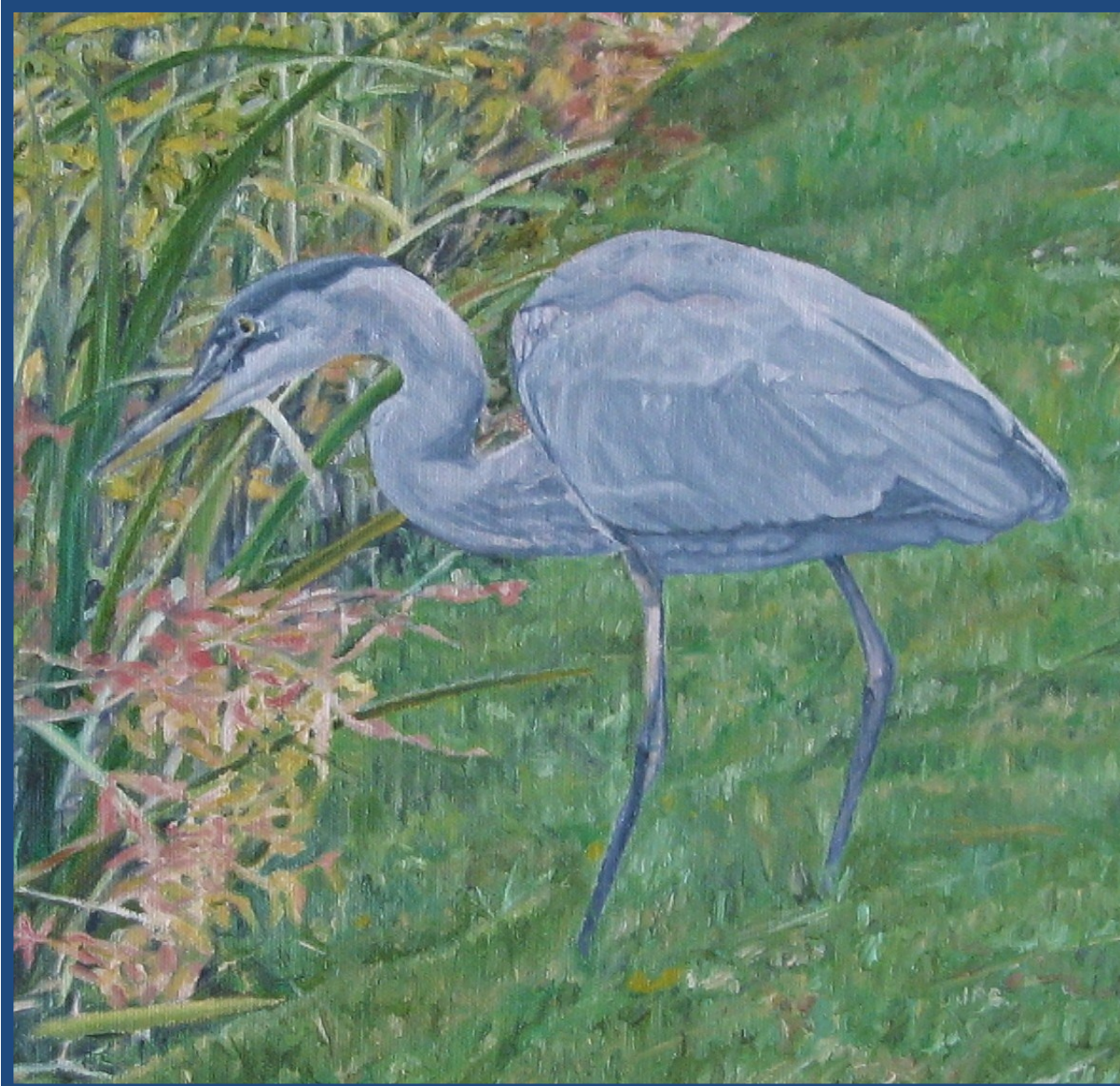
"Heron," 10" X 10," water miscible oil © Joe Godleski