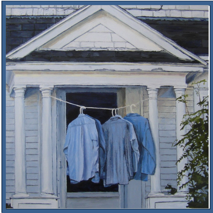
"Blue Shirts," 10" X 10," water miscible oil, © Joe Godleski

*See featured artist, Joe Godleski, interview pages 4 and 5.