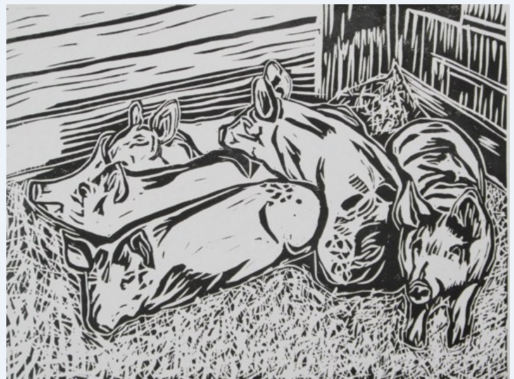
"Pigs," 10" X 8," acrylic block ink on paper © Joe Godleski

Being creative for me means being faithful to the creative process as it works for me, learning from each creative attempt, and moving on when a work is done.